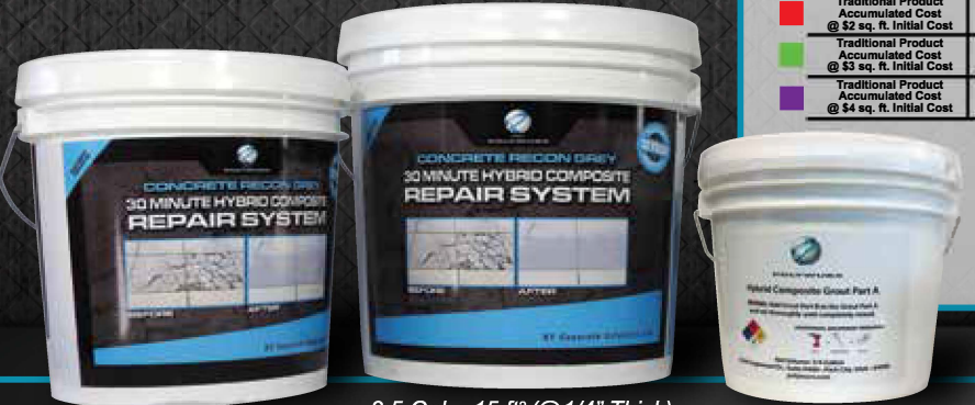
2 Gal = 10 ft 2 (@1/4" Thick)

Lawsuits are up 27% for concrete and asphalt related personal injuries. Let us teach you how we have helped several national brands overcome this expensive issue.